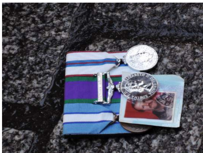
Four veterans left their service medals outside Downing Street on December 8th

Staying behind to photograph the medals on the ground, that looked so tiny, [continued on page 6]