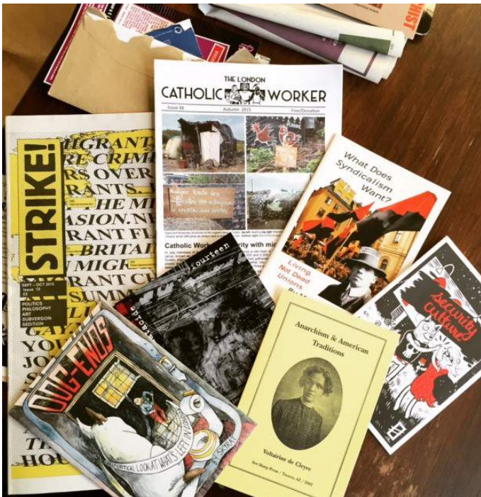
The London Catholic Worker joins some of the other 'zines' on sale at the London Anarchist Bookfair

This autumn the community has been active in hosting talks, workshops and celebrations. Catholic Workers ran a stall at the London Anarchist Bookfair, during which Nora Ziegler gave a seminar on 'radical hospitality'. The participants discussed the possibility of radical response to the growing number of refugees and the securitisation of borders in Europe. The seminar investigated the role of hospitality in organising in solidarity with refugees and migrants. But also discussed were the dilemmas around donating to the camp in Calais, where many volunteers are hard pressed, but which might also be attracting 'misery tourism'. Some stressed the importance of building community with the inhabitants at the camp, even for a short time, while others pointed out that, for some individuals, it would be the first time that they had taken part in an alternative, political project which has to be a positive thing.